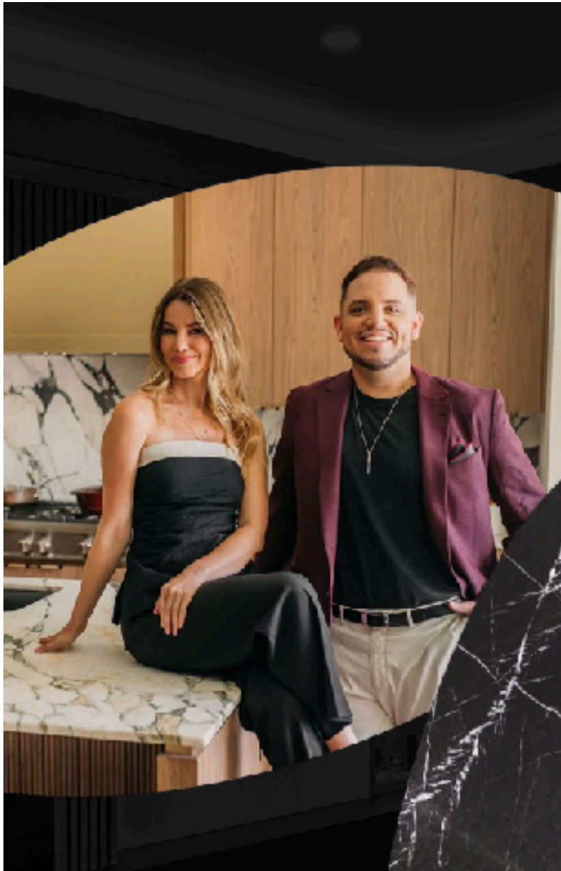
DESIGN TO WOW