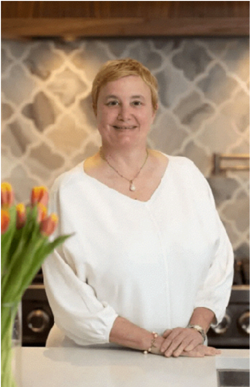
KITCHEN DESIGN CONCEPTS